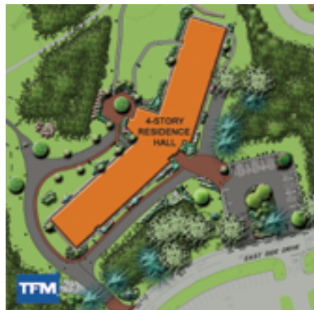
Site Plan by TFMoran, Inc.