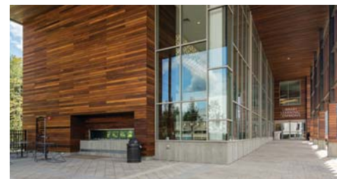
Exterior fireplace patio