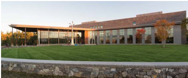
Learning commons at SNHU

Manchester, NH – A ribbon cutting ceremony was held recently for the new $18 million, three-story, 50,000sf learning commons at Southern New Hampshire University (SNHU). The new commons, designed by Perry Dean Rogers/Partners Architects is a signature building at the center of campus; functional, practical and aesthetically pleasing.