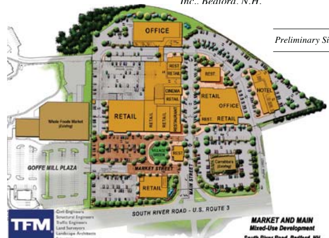
Preliminary Site Plan

MARKET AND MAIN Mixed-Use Development South River Road, Bedford, NH