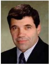
by Robert Duval

Over the past few years, TFMoran has been tasked to design several large development projects with major retail and other commercial components based on the “mixed-use development” (MUD) model, rather than the more traditional “shopping center” or “office park” formats. The difference is significant. Mixed-use developments feature a blend of distinct functions, often including — besides office or retail — residential, institutional, cultural, and industrial components, that are physically and functionally integrated, along with effective pedestrian connections.