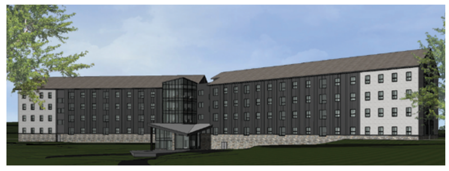
Monadnock Hall / rendering by Mackey Mitchell Architects

The exterior of the structure is a new design for SNHU, made up of natural stone and metal panels. A ribbon-cutting event is planned for early September, after students get settled into their new home.