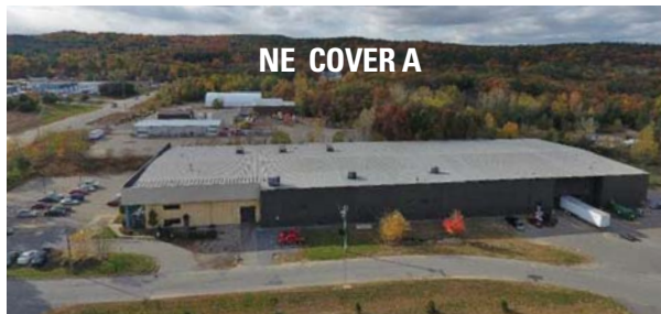
NE COVER A

Mancini and Egan of Kelleher & Sadowsky handle $5.1 million sale