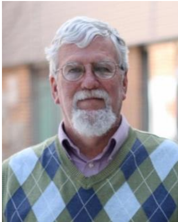
2020 Engineer of the Year