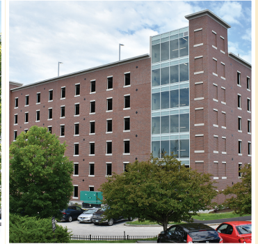
SNHU Millyard Parking Garage