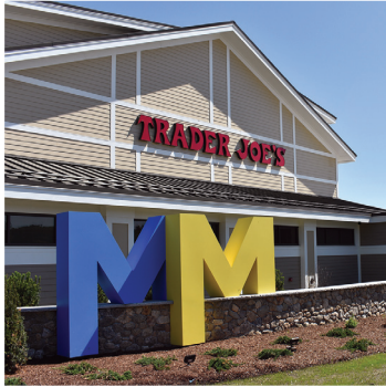
Trader Joe's at Market and Main