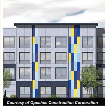
Courtesy of Opechee Construction Corporation Tru by Hilton Hotel ~ Concord