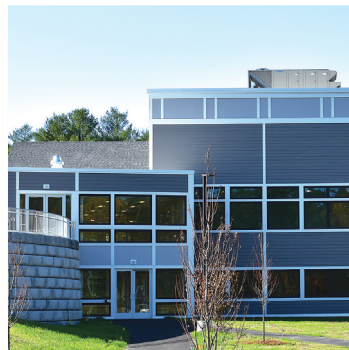
St Anselm College Welcome Center Derryfield School Athletic Center