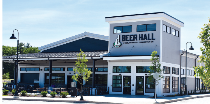
603 Brewery & Beer Hall at Woodmont Commons ~ Londonderry