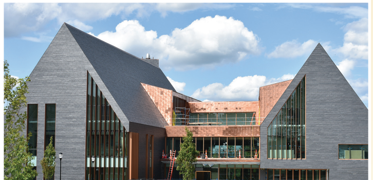
SNHU College of Engineering, Technology & Aeronautics