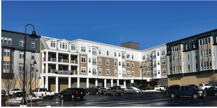
Main Street Apartments at Woodmont Commons ~ Londonderry