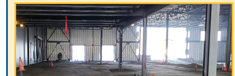
Structural Engineering Services for Bio-Techne Addition